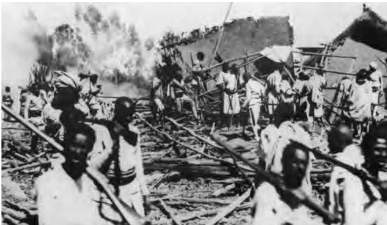
An Abyssinian village bombed by Italian aircraft in the invasion of 1936.

6 Study the photograph, and then answer the questions which follow.