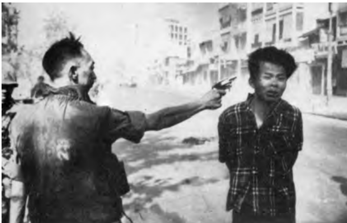
The execution of a Vietcong suspect during the Tet offensive, 1968.