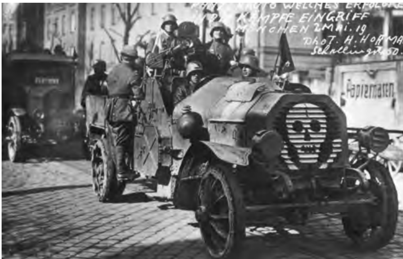
A Freikorps unit in Munich, May 1919.

9 Study the photograph, and then answer the questions which follow.