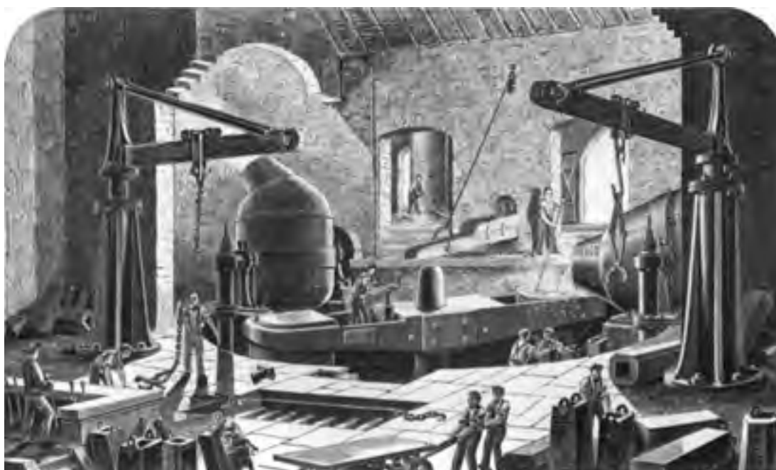
A Bessemer steel factory.

23 Study the picture, and then answer the questions which follow.