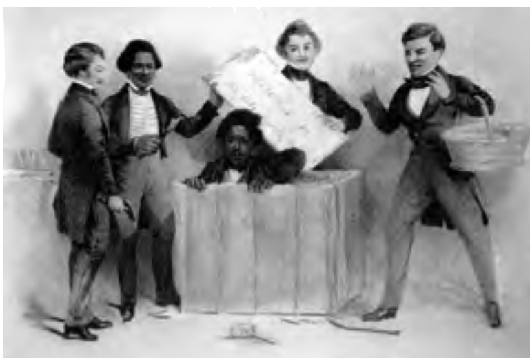
The escape of a slave from Richmond, Virginia to Philadelphia in the North.