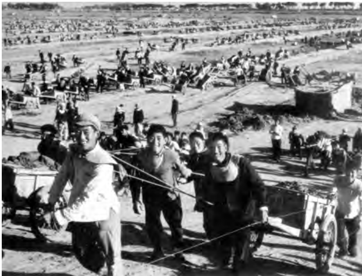
Chinese workers on the Haiho River Project.

15 Study the photograph, and then answer the questions which follow.