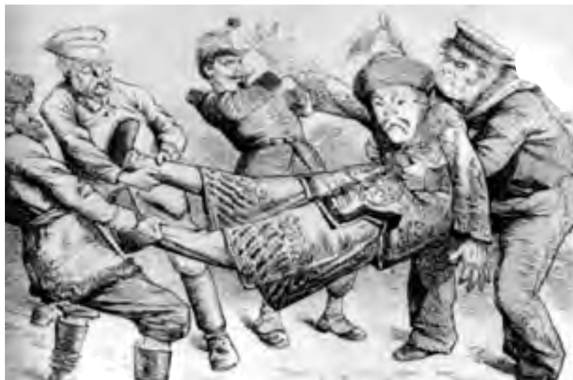
A nineteenth-century cartoon showing China being pulled by several European countries in different directions.

24 Study the cartoon, and then answer the questions which follow.