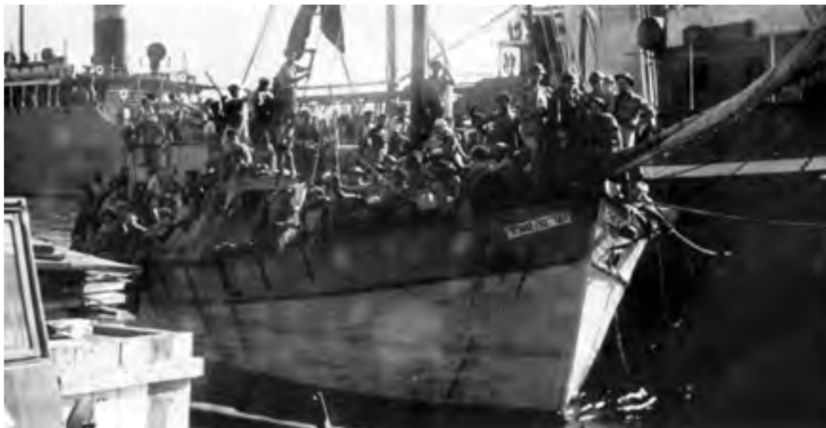
A refugee ship being sent back from Palestine to Cyprus by British soldiers in 1946.

20 Study the photograph, and then answer the questions which follow.